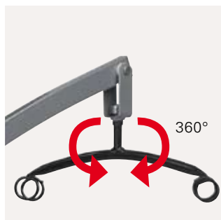
Spreader bar Spreader bar rotates 360 degree for easy positioning of the patient.

The control box of the Kirilos and the electric version of Atlante are equipped with emergency lowering and emergency stop. The battery status is displayed visually and an acoustic signal indicates a low battery.