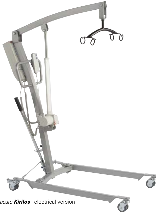
Invacare Kirilos - electrical version