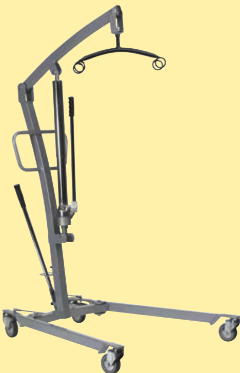
Invacare Atlante - manual version