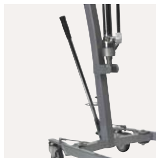
For easy leg opening Equipped with a handle for comfortable leg opening.